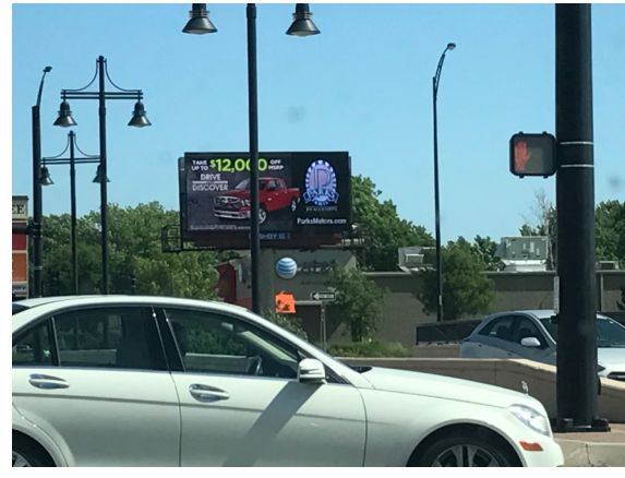
Our competitor's 12'x24' digital posters are much smaller than the size of Atomic's 14'x48' digital billboards.

DON'T BE FOOLED BY A "MONEY SAVING BUNDLE" Our competitor's posters, included in their "bundles" and "packages," are 1/3 the size of Atomic's bulletins!