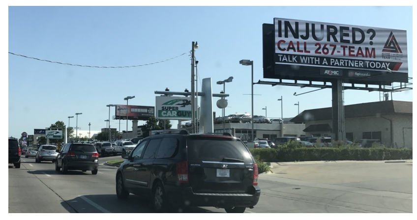
Atomic's 14'x48' digital bulletin on N. Rock Road. Catches traffic moving northbound with no obstructions and close to the road.